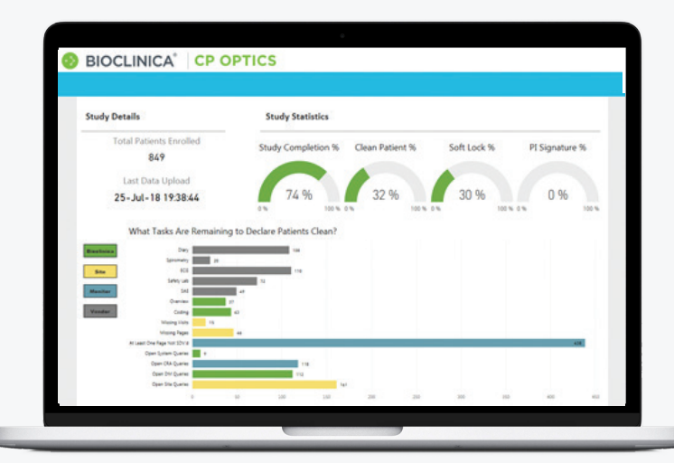
FIGURE 4: Example of a visual dashboard showing clean patient status based on the aggregated data

The visuals allow the operational and management teams to quickly ascertain the information they need to support their decisions, which is key because speed is paramount as sponsors move closer to database lock.