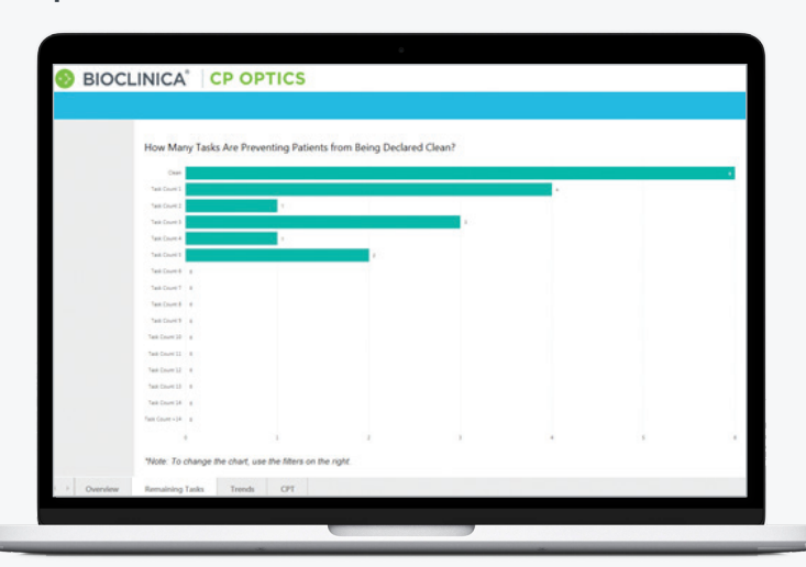
FIGURE 3: Target filtering in an aggregated data tool provides information about the number of tasks remaining.

Through a combination of target filtering of the aggregated data and the built-in formulas and functions, sponsors can easily distill the clean patient data down to manageable subsets for critical decisions related to database lock. For instance, the aggregated data can be filtered to identify patients that could become problematic for a timely database lock because their number of open tasks is greater than desired.